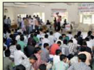
Thalassemia Camp Dt. 7 th September, 2012