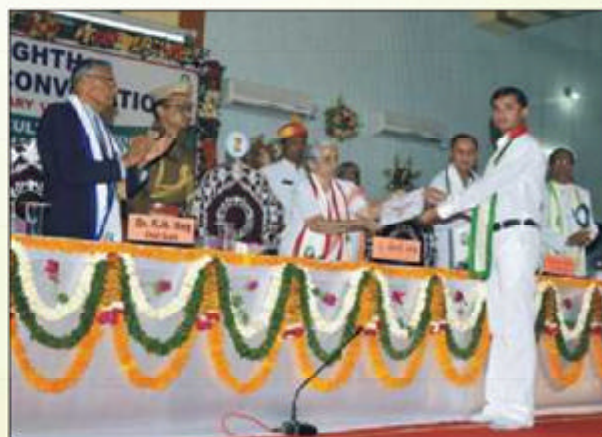
8 th Convocation of JAU Dt. 17 th January, 2013