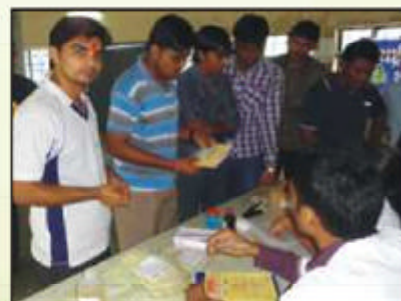
Blood Donation Camp Dt. 22 nd September, 2012